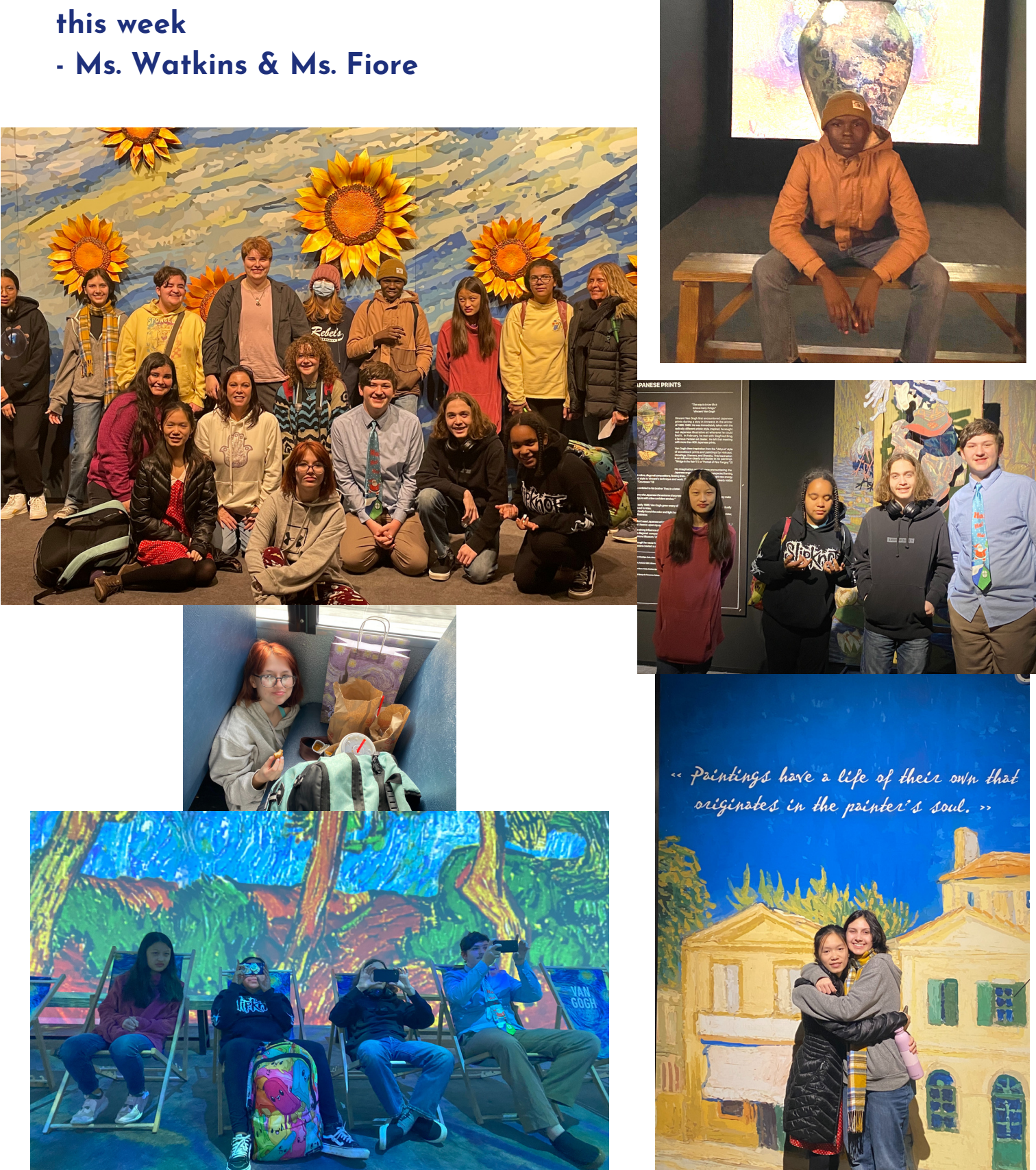
CARING, CONNECTING, MAKING A DIFFERENCE

Students had a great time visiting the Van Gogh Immersion in Schenectady this week