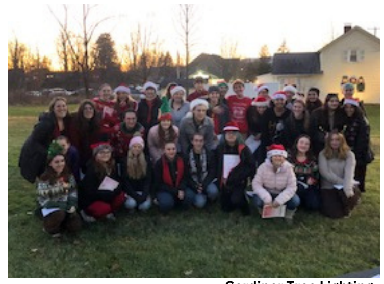
Gardiner Tree Lighting

The NPHS Caroling Choir is a group of students who are all members of the NPHS Mixed Choir. These students volunteered their time to learn holiday carols to help spread cheer through our community. We are proud of them, and are grateful for their time and talent!